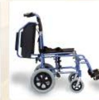
Flip back armrest.