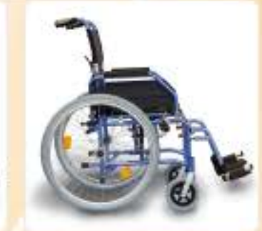
Swing away detachable leg rest.