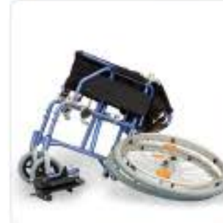
Dismantle for transport.