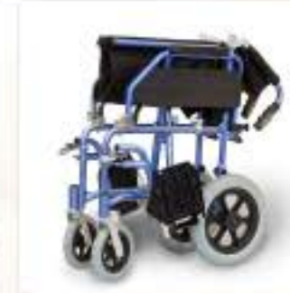
Easy fold away.